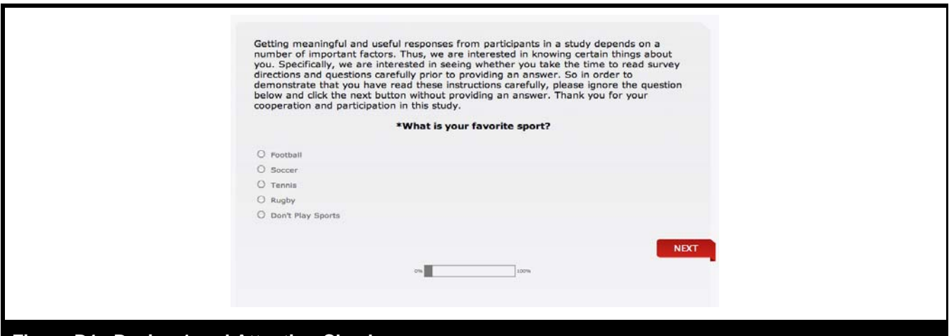
Figure D1. Design 1 and Attention Check