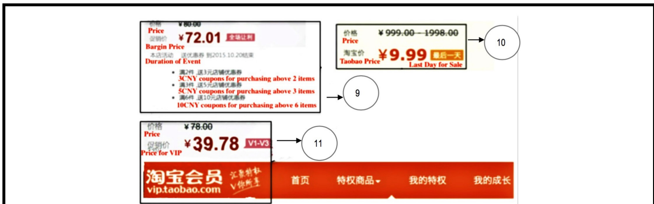
Figure A3. Platform-Based Functions in E-Marketplace (Taobao)

Notes: 9. Coupons; 10. Time-limit discount; 11. Platform VIP