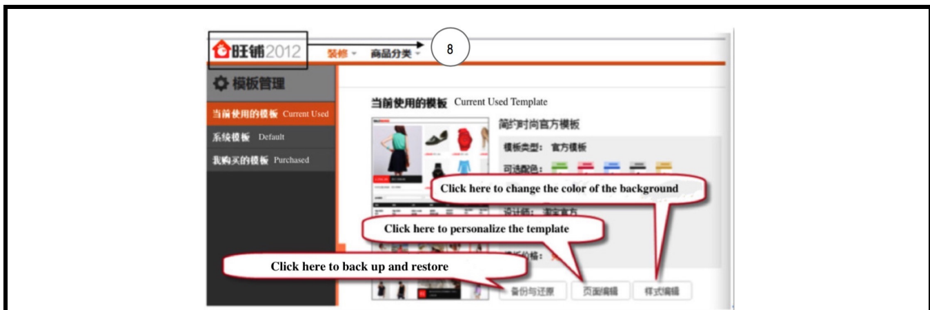
Figure A2. Platform-Based Functions in E-Marketplace (Taobao)

Notes: 6. Price bundling; 7. Cumulative quantity discount with free postage